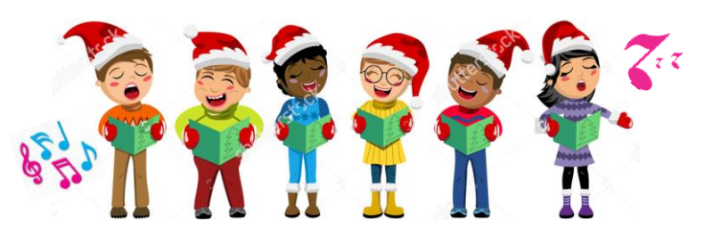
Our little ones will be putting on a holiday performance. Join your child's class for our Winter Wonderland Concert. See the class teacher for more info.