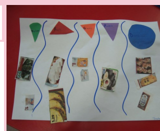
Sorting Food Groups

Parents, children always love to share so this month they are welcome to bring in their favorite holiday books so I can read it to them Happy holidays and well see you next year!