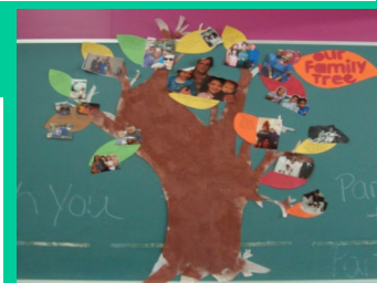
Class Family Tree

themes that we will work on will be insects, nursery rhymes, and some other exciting things. If there are any ideas or crafts that you would like to share with us feel free to talk to us. Until next month!