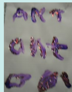
Upper & Lower Case Art

Parents are always welcome to come in and volunteer, and please don't forget to check Teaching Strategies for information on your favorite Chipmunk's progress and activities.