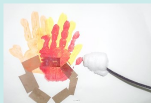
Gather Around The Camp Fire

Happy September, and welcome to all of our brand new students! Starting in a new class calls for a fresh start and as we slowly transition into the fall season, we have a lot to prepare for. Last month, we explored money concepts, camp-