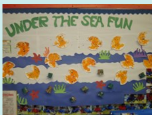
Under the Sea Animals

We are close to saying bye to our warm days! For the month of September, the children will learn about letters M and F. We will talk about manners, friendships,