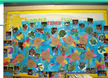
Summer and Water Animals

Parents as always feel free to share any ideas you might have and thanks again our students who have brought in books to share with their friends. Until Next month!