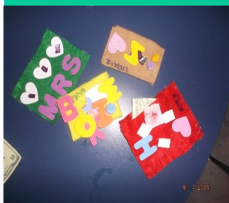
Wallets for our Money

Dear Parents, Happy September, and welcome to all of our brand new students! Starting in a new class calls for a fresh start and as we slowly transition into the fall season, we have a lot to prepare for. Last month, we learned about money concepts, camping, and rocks. In the month of September, we will review classroom guidelines, school safety and talk about our