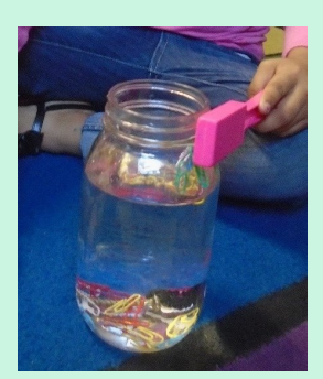
Magnetic Objects In Water