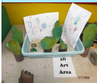
Our Classroom Desert Model