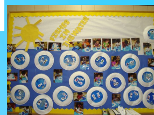
Fish in a Tank