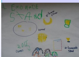
"Lemonade Stand" Sign

Happy July to all families! Last month we talked about zoo animals, lines, and summertime. This month, the Butterflies are ready to discover so many things. Summer has finally arrived, which means there will be many outdoor activities planned. In the first week,