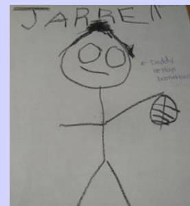
Father's Day Project

have learned. We will continue improving our early reading skills with a guessing game, clue game, rhyming words, sounding out the letters, reading books, etc. The children will also continue practicing writing their first and last names. A variety of art projects, games, and outdoor activities will accompany our learning.