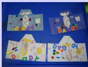
Father's Day Cards

Summer is coming which means more fun time with outside activities! For the month of July, the theme will be summer fun! The children will do many fun, exciting activities outdoors. Some include, but