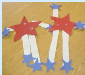
Flag Spirited Puppets

Now that the month of May is gone we will look forward to a wonderful summer! Last month for Memorial Day, the children had fun making flag spirited puppets!