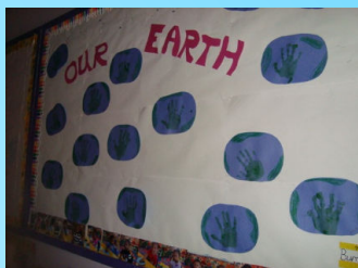
Our Earth Paintings

April showers brings May flower! Last month, we focus on Earth day, planting and Easter. We did many exciting activities which included; egg hunting and hand print earth. This month we will continue to focus on