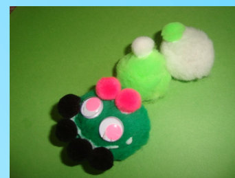
The children made insects using the art materials.

Parents are always welcome to stay and chat as long as they wish, read books to the children, bring books related to the themes or help with the kids'