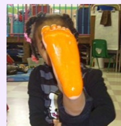
"The Foot" by Dr. Seuss

no more snow. We look forward to talking about spring like I mentioned, which will include, but not limited to plants, animals, and decorating our classroom to have that spring feel. See you next month!