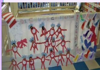
Dr. Seuss: Thing 1 and Thing 2

Spring is finally here! The children will enjoy the warm weather ahead. For the month of April, we will continue to talk about spring and themes related to spring such as: butterflies, ladybugs, flower gardens, kites, and so much more exciting projects!