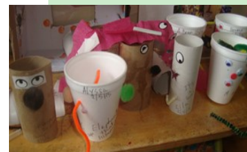
3D Hibernating Animals

celebrate St. Patrick's Day and Dr. Seuss's birthday. We are excited to spend some time outside as the weather changes.