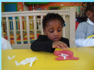
V's on our Vase

March is here and that means spring is around the corner! The children will have fun this month celebrating Dr. Seuss birthday and St. Patrick day. For the month of March, our letters will be letter S and letter M! The