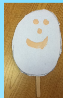
The children made "Me Puppets" and then created puppet shows.