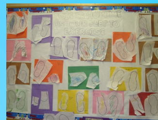
Our Exercising Feet

If you have any questions feel free to ask.