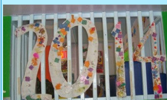
Our 2014 Banner

The month of January has already gone by, and we are ready for February. Last month, we celebrated the New Year with a healthy start by discussing topics like healthy living & nutrition, body parts, and friendship (in honor of Martin