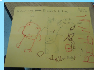
The children drew pictures of their dreams for the future.

If the weather permits, we will go out to play. Parents, please send your child with warm jacket, snow pants, gloves, hat and boots. Your child doesn't want to miss the snow fun.