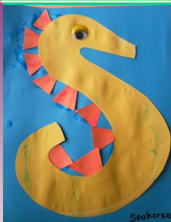
S if for Seahorse