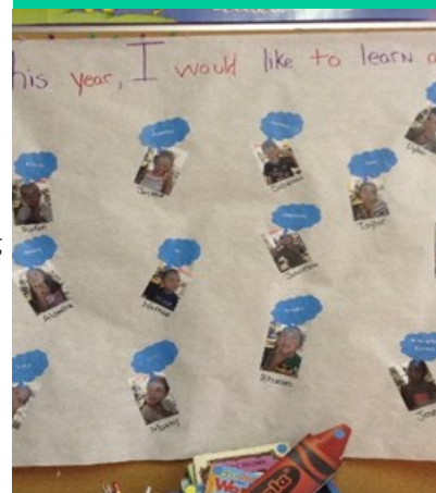
What we want to learn about poster