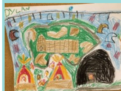
Native American Homes

son plans there will be a set of projects and games that will help bond the new students with the older students. Parents: With the new school year, please have your child prepared by bringing in a new set of clothes. Also if you would like, we can meet to discuss what to expect this school year.