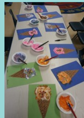
Ice Cream Cones

work back on the due date and please go over the worksheets with them. Lastly, thank you to all my parents for attending the parent-teacher conferences, they were a success! I really appreciated it.