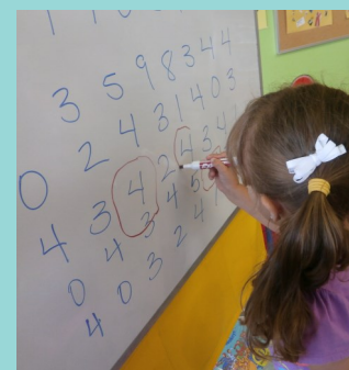
Number Puzzle Search

will also have a butterfly poster template in which the children will take home to decorate and later present to the class. This will be a fun family assignment! We will also continue with the usual academics along with writing and identifying the 1st letter in our names. Furthermore, we will be going on a field trip to the Museum of Science and Industry. This should be a fun time! Let's get the fall season started!