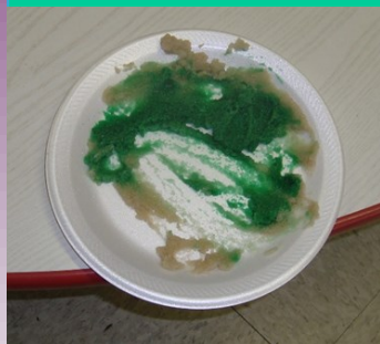
Feeling Colorful Sand

Hello September!!! We finished last month learning about the 5 senses. This month we will be focusing on aquatic animals under the sea and recreating these animals through arts and crafts. We will also be ending the summer with a bang and introduce the