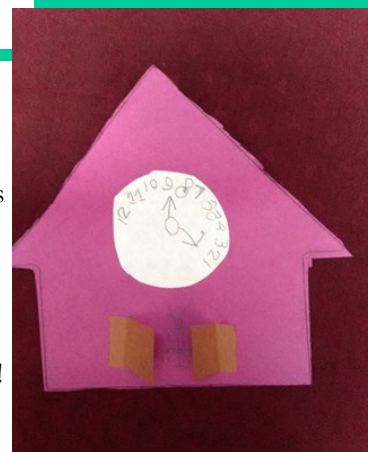
Coo Coo Clocks