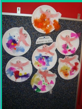
Our Bird Nests

In the month of August we had a camping week and thanks to mother nature she allowed us to have a camping day on the playground. We also learned about birds and their habitat. Finally, we had a pizza party to say