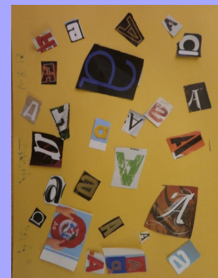
1st letter in your Name