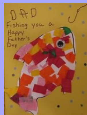
Father's Day Project

Parents: Please remember that we are entering summer, which means that there are some hot days ahead. Before your child enters the school, please be sure to apply sunblock on your child. Also, please be sure to update your child's clothing in their cubbies.