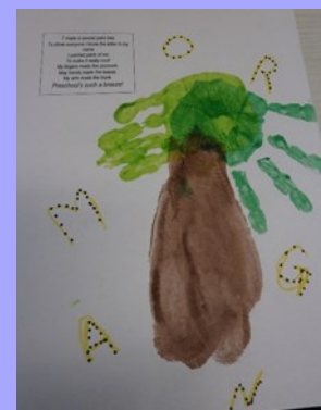
Special Name Palm Tree

July we will be learning about Independence Day, Ocean animals, and summer time, writing our first and last name, learning how to spell of our name and other sight words, experimenting with measuring tools, and blending colors.