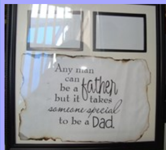
Father's Day Frames

For the month of June, we were able to discover the themes: Camping, frogs, and review the topics of Feelings and Free Zone Bullying. We have also used technology so we can have fun with learning. I want to say thank you to all the Parents who helped out