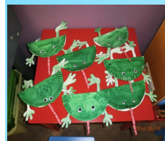
Paper Plate frogs

on a camping adventure in class. We will discuss the different things you bring on a camping trip and the different ways you use your 5 senses and the different type of bugs that they see outside. Please parents check cubbies everyday for homework package and the latest news, please and thank you. Ms. Barber