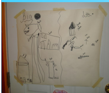
Opposites Big and Little

Happy 4th of July! To review the month of June, we began our opposites.