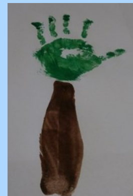
Handprint Rainforest Tree

summer, bugs and insects, letter recognition, spelling, remembering sight words, 3D shapes, experimenting with rulers and measuring tools, and much more.