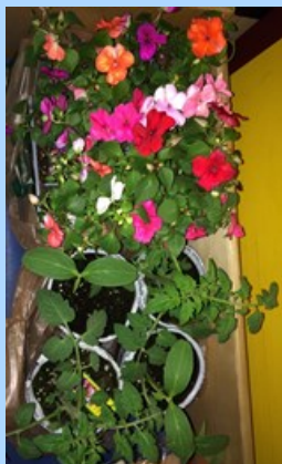
Flower & Vegetable Garden