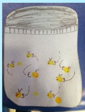
Bees in a jar

The Guppies class had an awesome month! We had great themes to celebrate such as bugs, spring time and earth week. We also learned about letters m and n. We practiced our writing as well as our math skills like odds and evens and addition and subtraction. And our class was finally able to go outside! We are loving this weather and hope that we get more