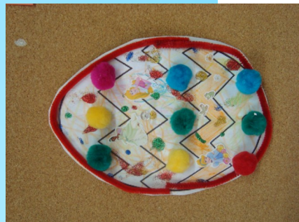
Easter Egg Art

Last month was exciting as we entered spring and enjoyed a lot of fun spring activities such as our Easter egg hunt. Now that we