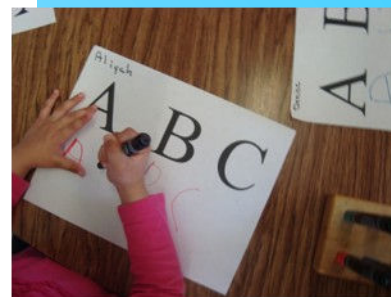
Letter Writing Practice

the alphabet and numbers. In addition, we will work in the science area; the students will discover the world of plants by: planting seeds; watching them grow; and caring for them. We are going to reinforce our color recognition by making the rainbows. Finally, May is going to be a fantastic month to incorporate more outdoor activities if Mother Nature allows us.