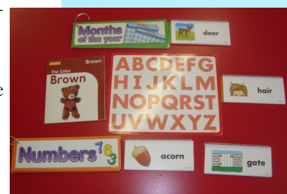
We've been practicing letters numbers and writing skills.

throughout the month of May as well as working on sight words and our math skills. The class and I hope that SPRING is on its way so that we can take walks around the neighborhood.