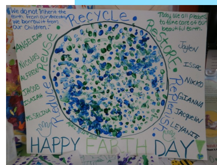
Our class earth using only our fingertips.

month will be Dr. Seuss month. The children will focus learning new topics by using Dr. Seuss books as their topics. This is going to be a great month, I love Dr. Seuss and so do the bumble bees.