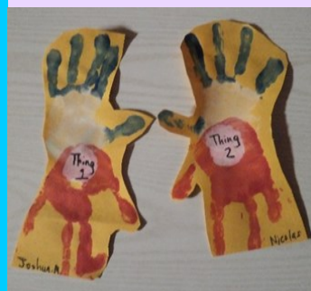
Thing 1 and Thing 2 Handprints

first and last names. So parents please pay close attention to your child's progress on letter writing. I will be informing you on upcoming projects in our class as well. Finally, parents please check cubbies for daily art work, news, and homework sheets. All homework is given out on Monday and should be returned on the expected due date and put in the purple basket, please.