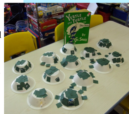
After reading Yertle The Turtle, the children made their own turtles.