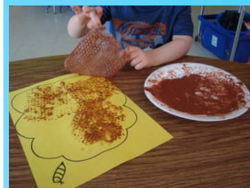
Catacombs for Caterpillars

Boats and Floats! Your children will love splashing up their imagination in this water filled theme. Experiment with what will sink and float. Children will create a pretend river and a sailboat that floats. Water is an important natural resource. Your children will learn how to preserve, appreciate, and protect our water.