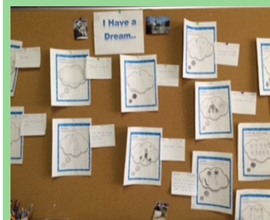
"I Have A Dream" Project

Parents, I will be holding parent-teacher conferences at the beginning of March. If you have any questions or would like to meet with me just let me know and I will be happy to help. Thank You!