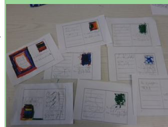
Mail for the Post office

value of loving one another so we painted our hearts red and pink. For the month of March we will continue to focus on recognizing our name and letters, shapes, colors, friendship, food groups and dinosaurs.