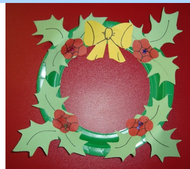
Winter Fest Wreath

crafts. This year we will continue to work on academics with the children (counting/identifying 1-30, the alphabet, shapes, calendar, etc.). We will also work on writing our names this month.