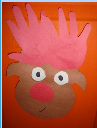
Rudolph the Red Nose Reindeer