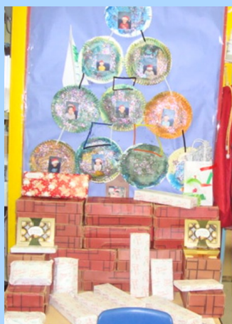
Winter Fest Tree