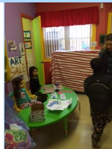
Donation for Feeding America