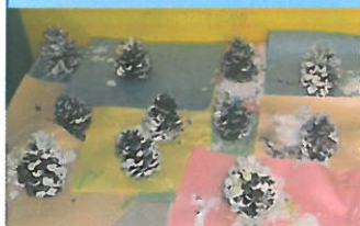
Our 'snowy' pinecones

We would like to wish all of our Toddler Town families a happy new year! We look forward to the good times ahead in 2014 for our classroom and beyond. In December, we had so much fun exploring shapes, weather, the winter season, and introducing the New