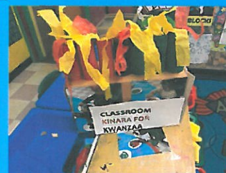
Our Kwanzaa Kinara