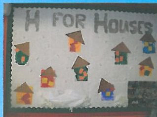
Focusing on letter H for the month of December,