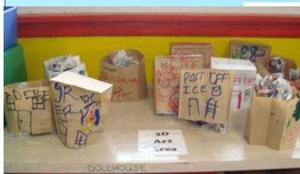
Our class community

Last month, we explored topics like transportation, community helpers, family and Thanksgiving. This month, we will learn about weather, shapes, winter, and the