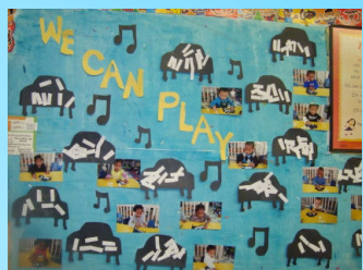
Our little pianos for letter P!

November flew by! Now we're in December, meaning colder weather! Last month, the children had so much fun giving thanks and being thankful! For the month of December, we will be talking about hibernation, snow, and enjoying the holidays