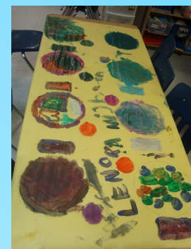
We painted healthy plates during our unit on Healthy Eating.