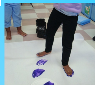
We painted with our feet.